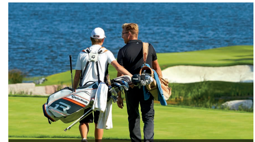
For all sports turf surfaces, including golf, tennis, bowls and winter sports, the Headway Maxx combination of two outstanding active ingredients for the control of turf diseases increases flexibility for use throughout the growing season – with improved performance and greater security.